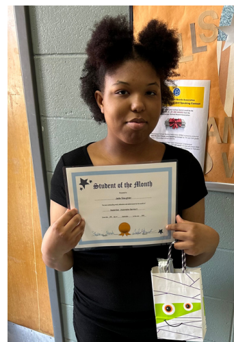
Jade Slaughter Automotive Service